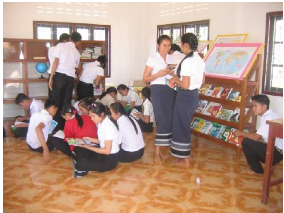
Students enjoying the books.