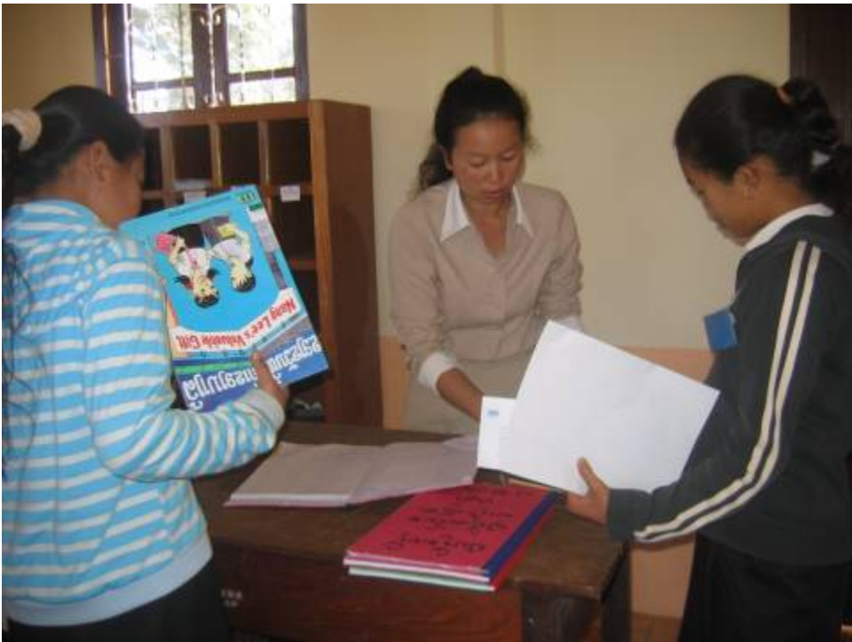
Students checking out books with teachers.