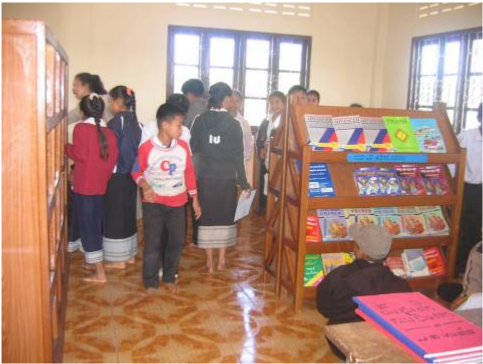
Students browsing books in the library.