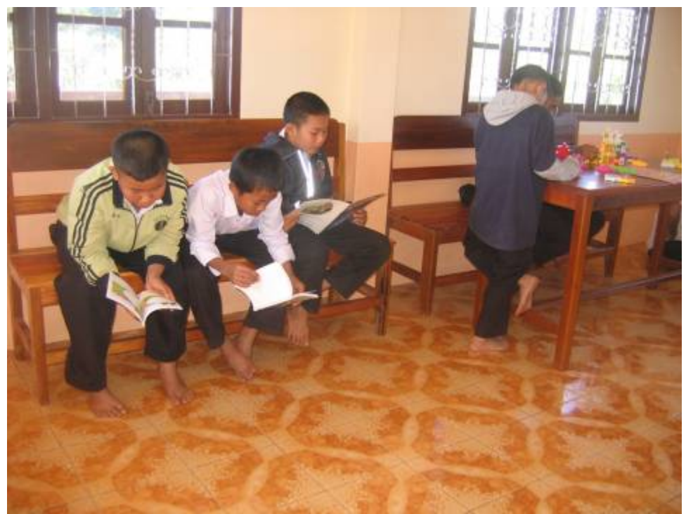
Students spending their leisure time reading in the library.