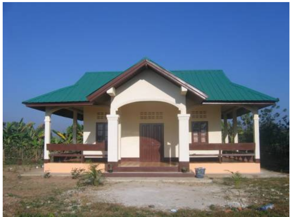
The overview of the newly constructed library building.